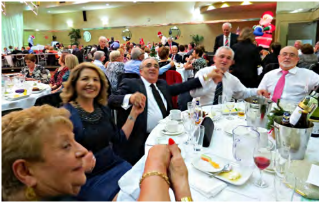
Below: THE HAPPY TABLE