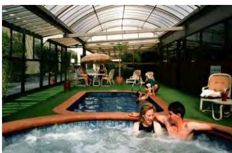
Above—The pool and Jacuzzi at the Elm Court Hotel—Albury

Our first weekend pokie trip for 2012 proved very popular as usual and this year we opted to stay at the Elm Court Hotel in Albury. This proved to be a great choice due to its proximity to the Commercial Club and its clean and comfortable rooms—also this being a large enough hotel to fit our whole group we have decided to go back to the Elm Court for all our weekend trips in 2012. ■