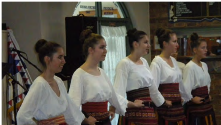
Above and Below—The Serbian Traditional Dancing Group Morovo Ensemble