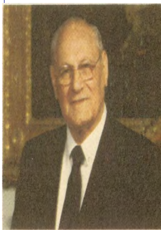
Tifkira għaziza ta Dr Censu Tabone President ta Malta 1989—1994 Twieled 30 ta Marzu 1913 u Miet fl-14 ta Marzu 2012

QATT M'INTHOM MINSIJA MILL- KLABB FOLKLORISTIKU TAL-GHANA MALTI - KEMM JEKK GHANNEJJA, KITARRISTI JEW DILETTANTI, INTHOM TAJTU SEHEMKOM FL-ISTORJA FOLKLORISTIKA MALTIJA U HALLEJTULNA WIRT PREZZJUZ BIEX INKOM-PLU NGHOSZUH U NKATTRUH F'DIN L-ART, IL-BOGHOD MINN ART TWELIDNA.