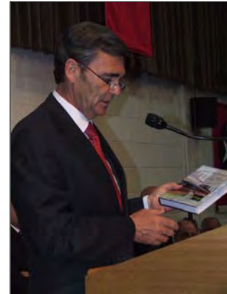
The Premier of Victoria, the Hon John Brumby officially launches the book, Under One Umbrella .