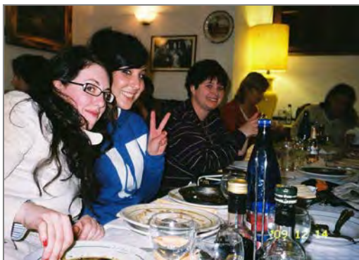
Victoria University Students enjoying dinner at an Italian restaurant in Rome.