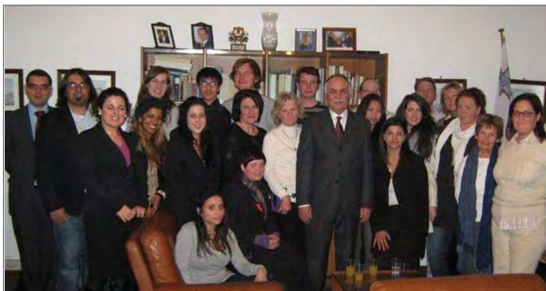
Victoria University Students pay a visit to the Maltese Ambassador in Rome.