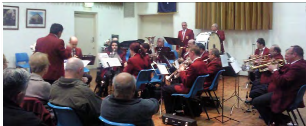
The Malta-Gozo City of Brimbank Concert Band playing marches for the occasion.