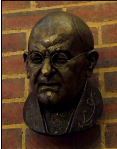
The bronze portrait of St George Preca

The blessing of the bronze portrait of St George Preca at St Paul's Chapel, Parkville