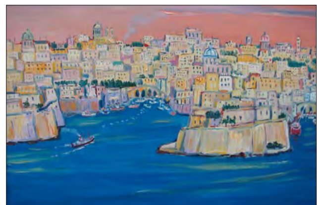
One of the paintings of the Grand Harbour exhibited.