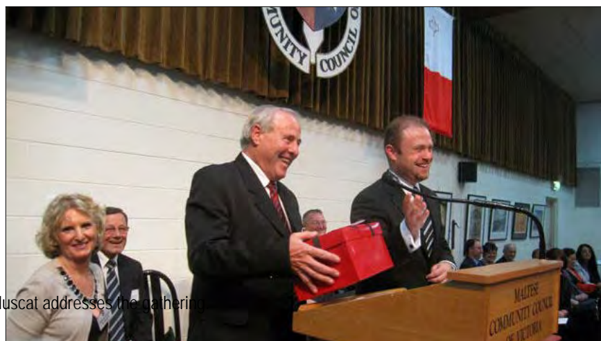
The Hon. Dr Joseph Muscat addresses the gathering.