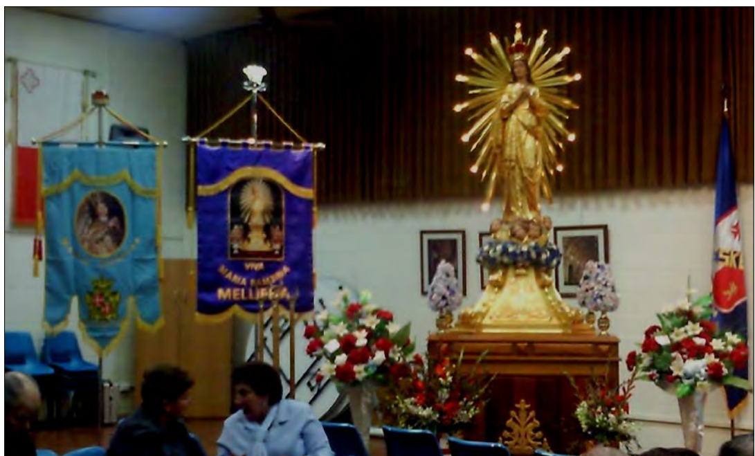
The banners and the statue of Maria Bambina in the hall of the Maltese Community Centre before the Mass.