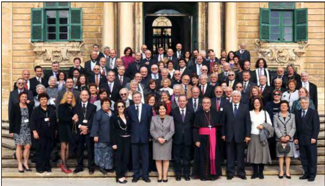
Participants at the Convention of Maltese Living Abroad in front of the Auberge de Castille after the reception.