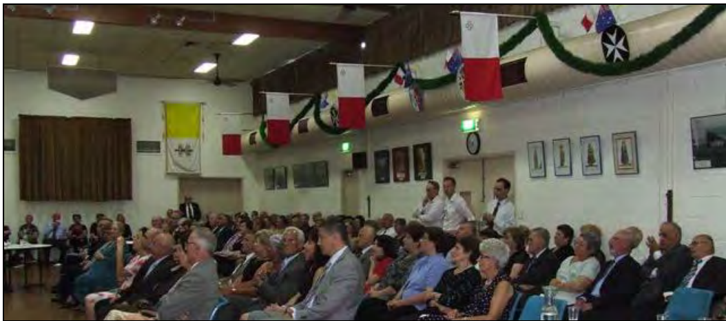
The gathering at the Welcome Reception