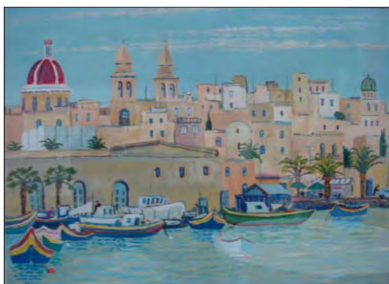
A painting of the fishing village of Marsaxlokk,