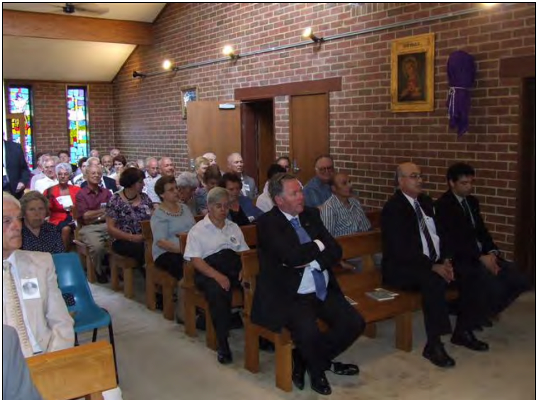
The congregation attending the ceremony.