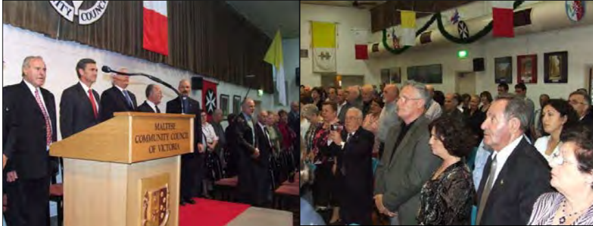
The official party and guests stand during the playing of the Maltese and Australian National Anthems .