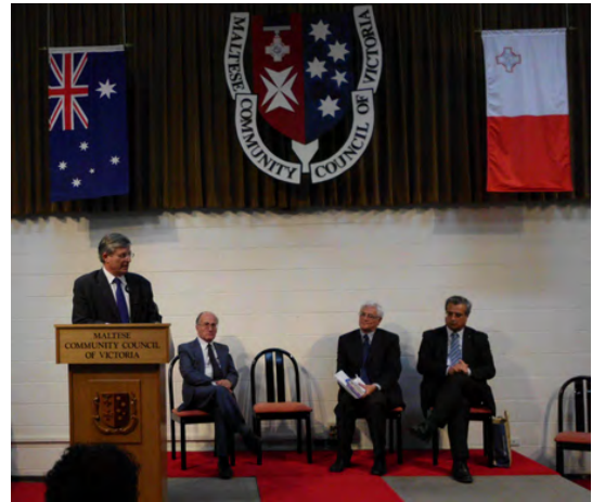
Deputy Prime Minister Dr Tonio Borg addressing the gathering at the Welcome Reception.