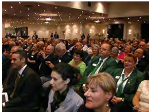
(Above) A section of the audience.