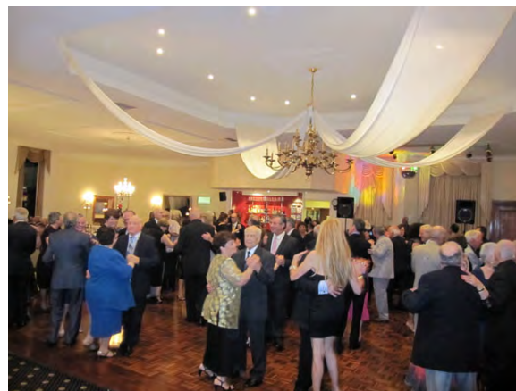
On the dance floor.