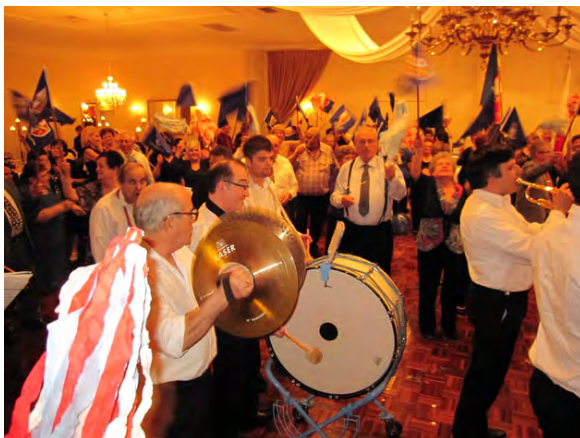
The brass band at the Vitoria Dinner Dance.