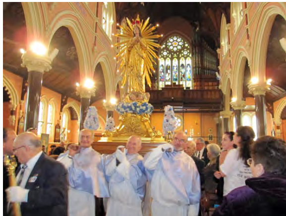
The end of the procession with the statue.