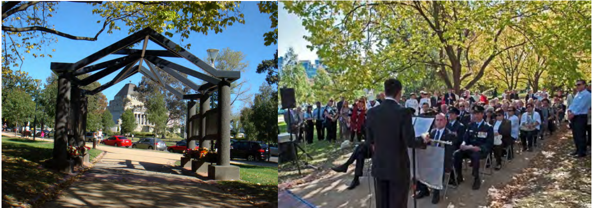
Above left: Shelter of Peace Monument with Shrine of Remembrance in the background.