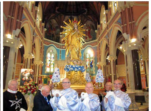
The end of the procession with the statue.