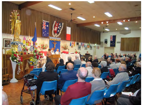
Mass on Thursday at the main hall of the Maltese Centre.