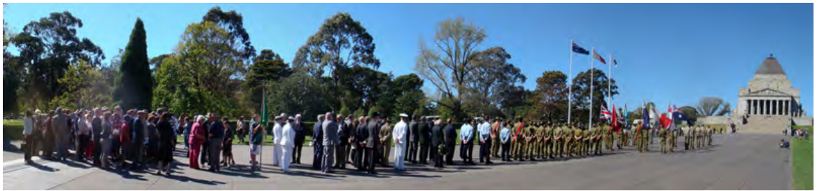
A panoramic view of the march up the forecourt to the Shrine of Remembrance in Melbourne.