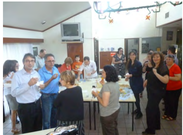
Students at end of Semester