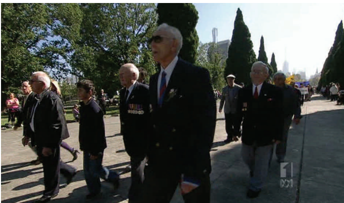
Below: Some of the Maltese veterans at the ANZAC march in Melbourne

Maltese veterans also served in the subsequent theatres of war including Korea in the 1950s and Vietnam in the late 1960s and early 1970s. □