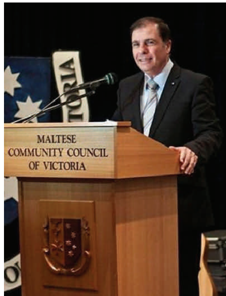
H.E. Dr George Abela making his address