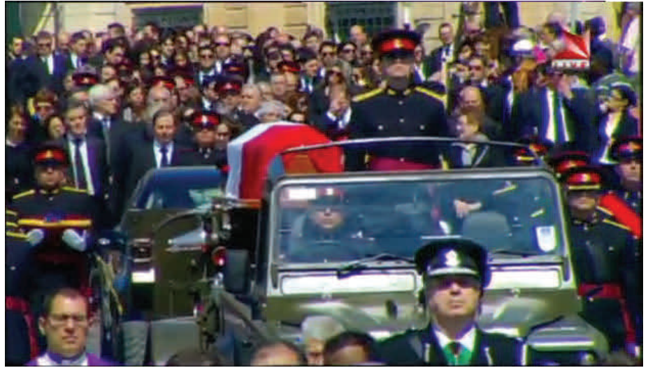
State Funeral cortège led by President Abela following the Mass at St John's Co-Cathedral

In his homily, Archbishop Paul Cremona, who led the Mass and was assisted by, among others, Gozo Bishop Mgr Mario Grech and Archbishop Emeritus Mgr Joseph Mercieca, said that the people's consolation for their loss was that Dr Tabone lived surrounded by Christian values. His faith was strong and made him who he was. He attended Mass daily, prayed and was devoted to Our Lady and did his utmost to live close to her. He loved the people and managed to be guided by the values of honesty, respect, love and justice throughout his distinguished political career. He combined his marriage to love,