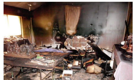
Charred remains of the MCCV boardroom