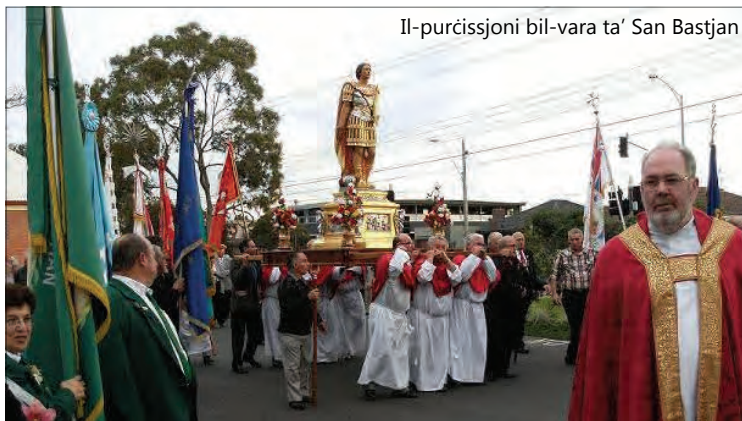
Il-purċissjoni bil-vara ta' San Bastjan