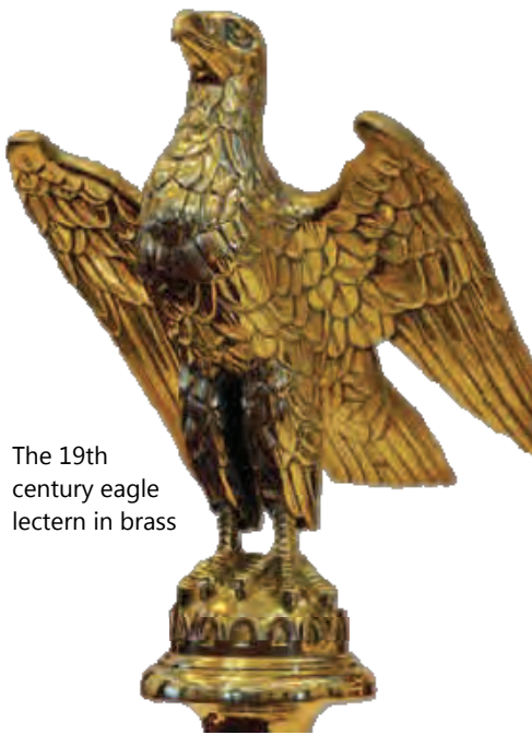
The 19th century eagle lectern in brass

St Mary MacKillop was completed (though there are still a few additions Mgr Portelli wants to make) in 2004. It is a large, unashamedly contemporary building, steel-framed with concrete infill, almost industrial in the simplicity of its structure. Yet its plan represents a return to tradition. After several decades of new churches planned like fans with pews on three sides of the altar, St Mary MacKillop is on the basilican plan with nave and side aisles. Its only structurally decorative elements are the internal columns with their capitals modelled on those designed for Coventry cathedral in England in the early 1960s and a rose window six metres in diameter high above the altar. The budget to build St Mary's was $2 million. "For that," Mgr Portelli was told, "you can have an outside or an inside, not both." He opted for the inside, so that when you pass through the porch the interior of the church speaks to you in a language quite different from the unadorned functionalism of the exterior. Works of art of Baroque and Gothic richness glint and glow against the plain background of the walls, which act as a foil to their beauty.