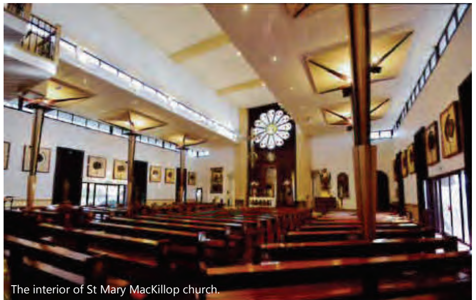
The interior of St Mary MacKillop church.

Reproduced with kind permission from Kairos Catholic Journal • www.cam.org.au/kairos 24 June-7 July 2012 issue.