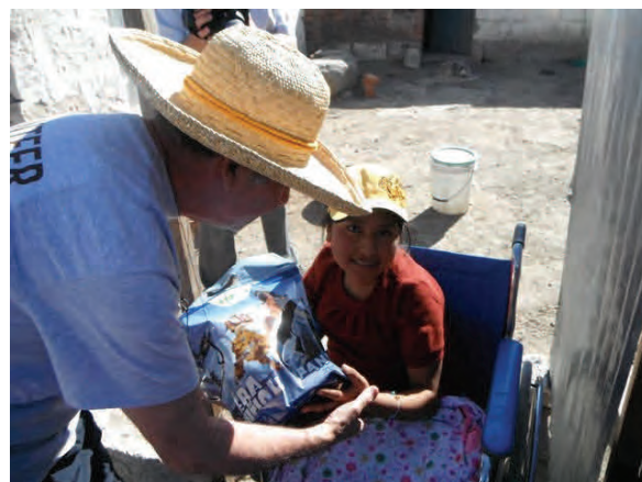
Dr George Abela with one of the locals in Peru.