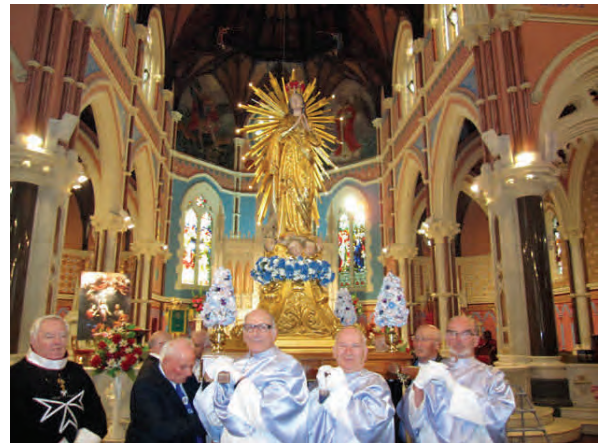
The statue of Maria Bambina being carried at the start of the procession.