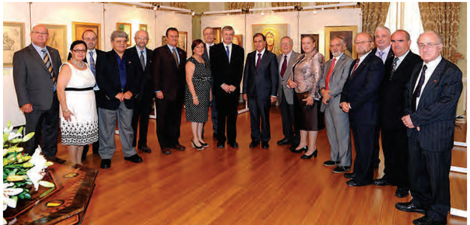
Above: Council members pay a courtesy visit to the President of Malta at San Anton Palace in Attard. Below: Prime Minister Lawrence Gonzi welcomes Council members at Auberge de Castille, Valletta.