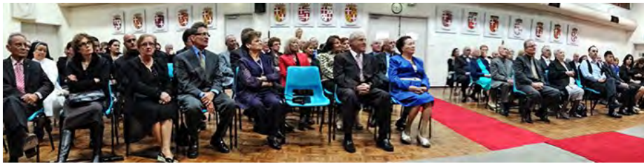
Above: The audience present to greet the new Malta High Commissioner and new Consul General for the State of Victoria