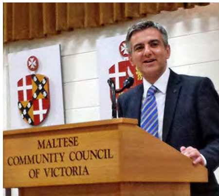
Dr Simon Busuttil addressing the gathering

Dr Busuttil said that, while this was the first time that he came to Australia, he immediately understood the importance of the Maltese community, how large and well