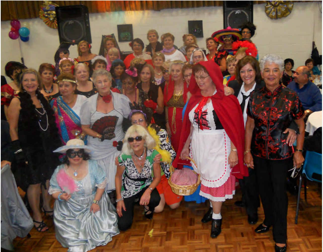
Below: The Ladies and the gents in costume at the Carnival Dance on 3rd March 2011