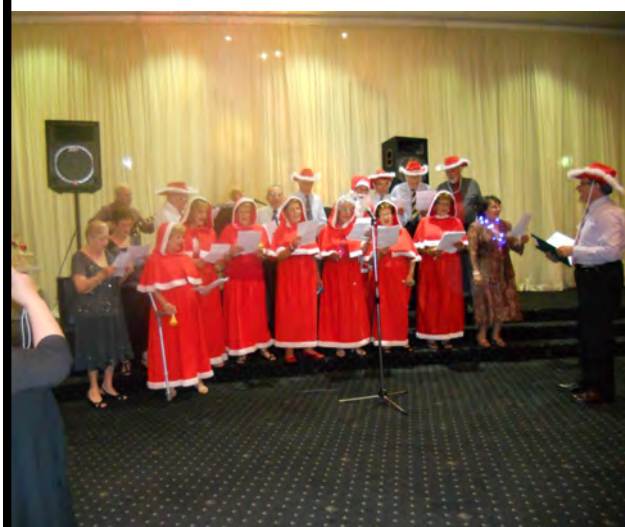
Below and Next Page: Photos from the Seniors Christmas Break Up

P.S. Don't tell anyone, but some left the area close to 6p.m.