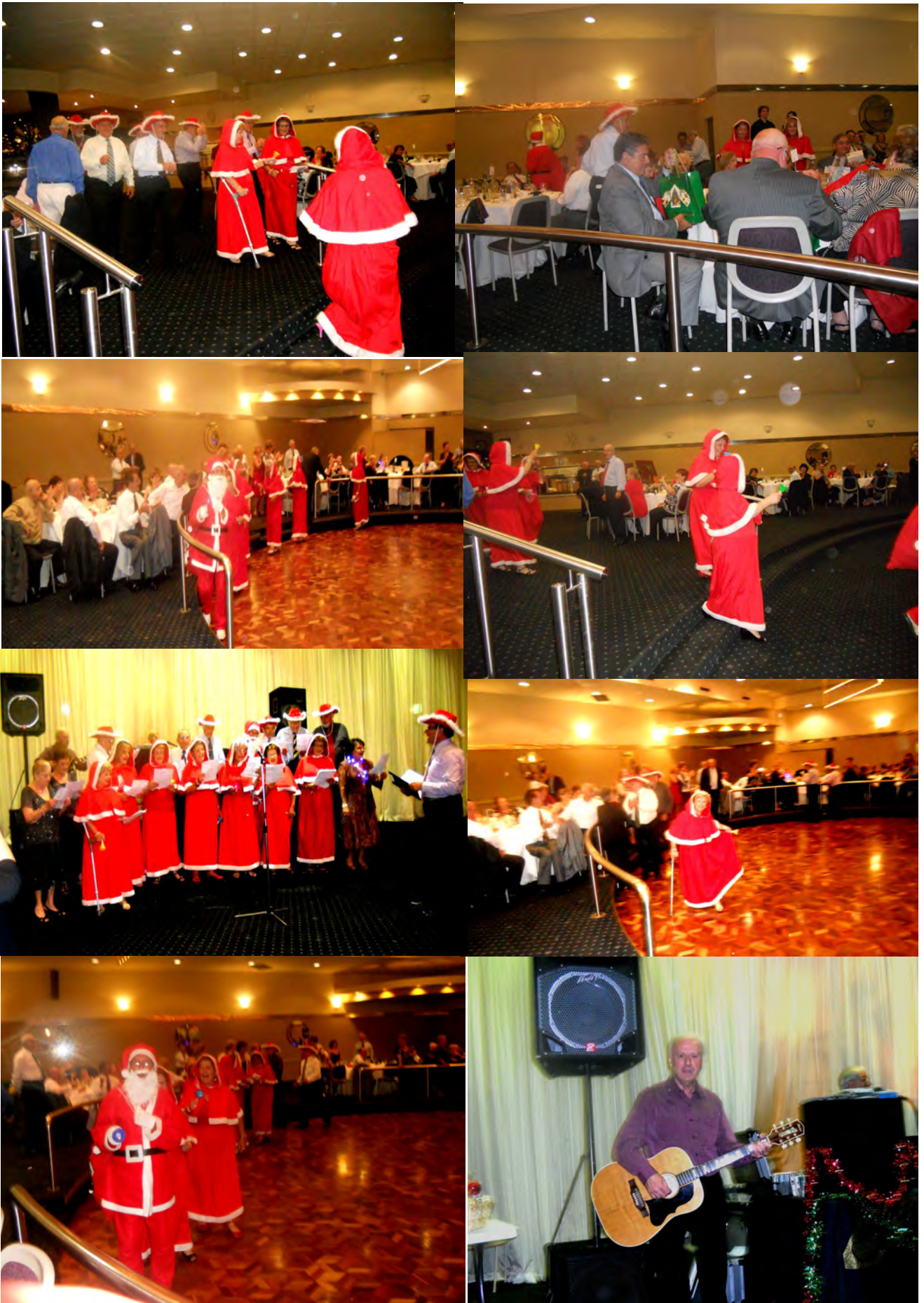
Above: Photos from the Newport Maltese Seniors Group Christmas Break-Up 2011 at the Melrose Reception