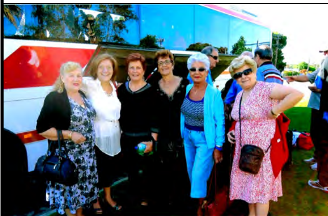
More photos from the Seniors' Weekend Away