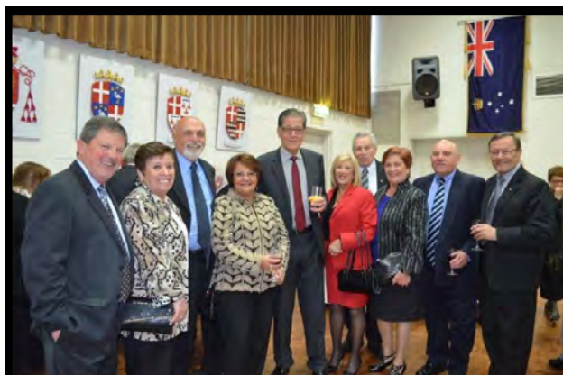
Pictured above: Committee members with His Excellency Mr Charles Muscat the new High Commissioner for the Republic of Malta in Australia