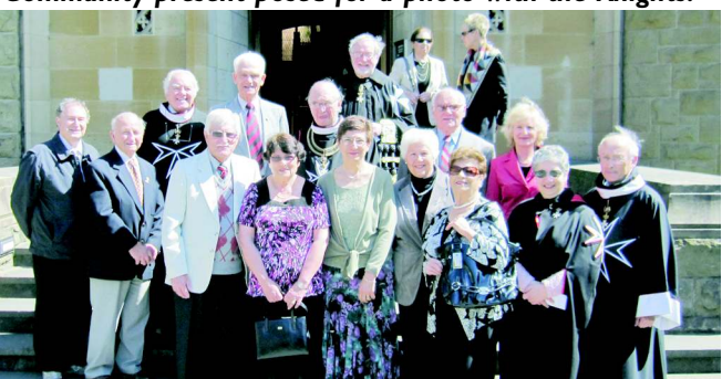
Photo: After Mass, some members of the Maltese Community present posed for a photo with the Knights.

It was a lovely ceremony as usual. A good group of the Maltese Community attended.