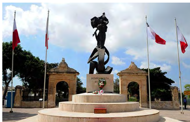
Independence Monument in Floriana