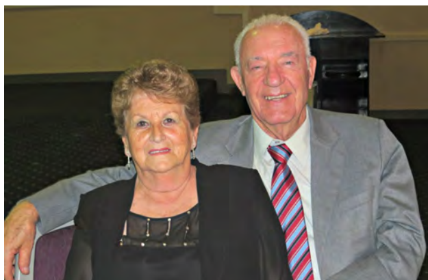
Below : Photos from the Annual Dinner Dance

Light refreshment was served after the meeting.