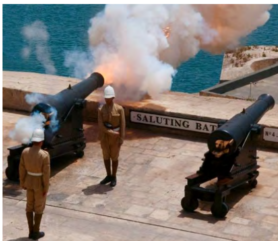
Malta Noon Gun Salute, Upper Barracca Gardens. Nowadays the gun salute is for "tourist purposes". However, in the past, the salute had a more practical use: it allowed ship masters to calibrate their clocks, to enable them to calculate their longitude accurately when out in open seas.