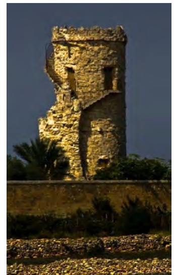
Bettina Tower Gudja: Part of Palazzo Bettina, where it is believed that Napoleon stayed during his time in Malta, when it was under French rule. It is also believed that Madonna stayed here during her visit to Malta. The tower is said to be the only Moorish construction in Malta.