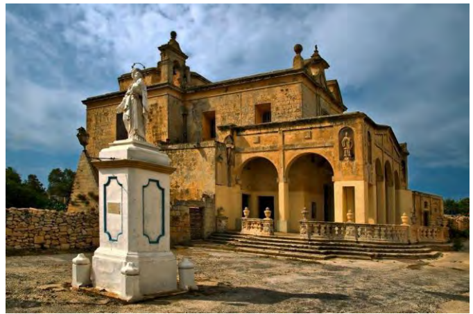
Chapel of the Madonna of Mercy, Qrendi: Built in the 13 th century in the old hamlet of Hal Lew, which later became part of the parish of Żurrieq, then of Qrendi. It was known as Our Lady of Grace until 1650, when it was rebuilt and given its current name. The Feast is celebrated on the Sunday after the 8 th September.