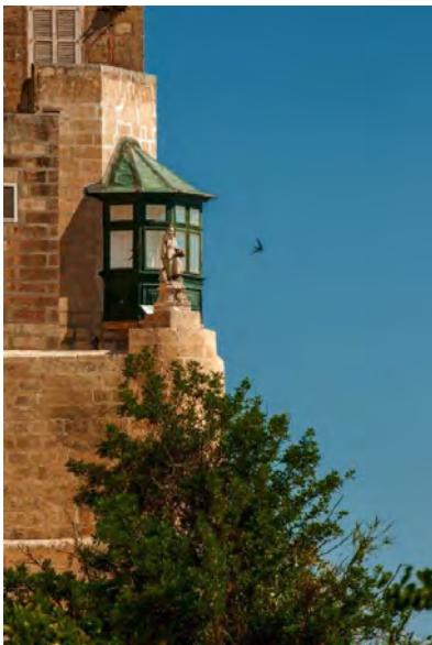
Malta Room with a view, Mdina: Window on the Bastion Wall of Mdina overlooking the valley below, towards Żebbuġ.