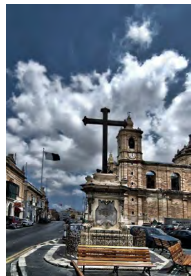
Cross in Żejtun Village Square: People from Żejtun would recognize this Cross immediately. It represents the "War Trophy" taken by the men of Żejtun, who attacked a French Garrison, forcing them to take refuge behind the fortifications of Valletta & Cottonera. This wooden Cross stood in front of the then abandoned Capuchin Friary in Kalkara.