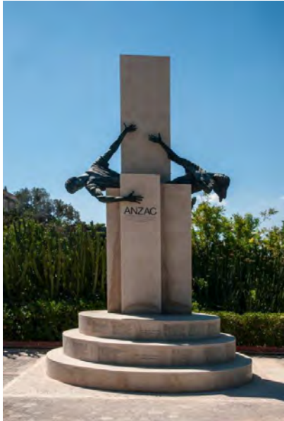
ANZAC Memorial: Inaugurated on 25 May 2013, it is located in the Argotti Gardens in Floriana. The memorial commemorates the 270 Australian & New Zealand soldiers buried in Malta