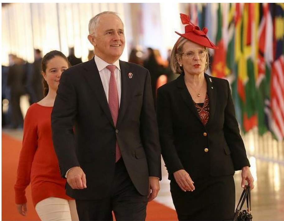
Prime Minister Malcolm Turnbull and his wife Lucy Turnbull arriving at the Mediterranean Conference Centre in Valletta for the CHOGM opening ceremony.

Commonwealth leaders attending the CHOGM Meeting in Malta last weekend agreed to set up a climate change hub to facilitate access to funds for the small and