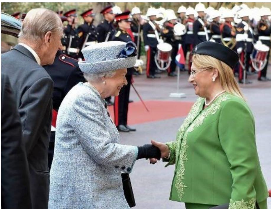
The President of Malta H.E. Marie Louise Coleiro Preca greets Queen Elizabeth II on her arrival at the President's Palace at Sant'Anton.

Prime Minister Turnbull also participated in a breakfast hosted by Prime Minister Cameron and President Khama of Botswana to discuss practical ways the Commonwealth can support efforts by member countries to tackle corruption, as well an event to highlight progress on the Global Polio Eradication initiative to which Australia has contributed $36 million over four years.💧