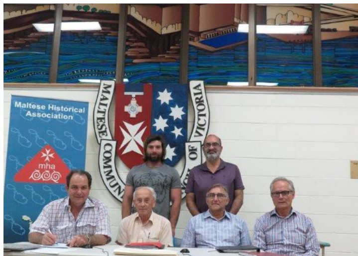
The MHA Committee for 2016