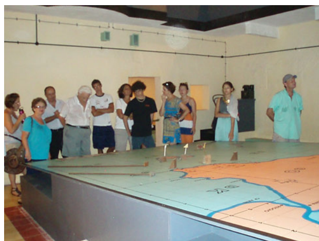
The plotting table as it stands to-day at the restored Lascaris War Rooms in Valletta