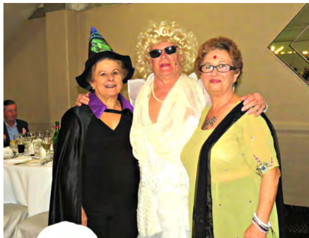
Photos from Fancy Dress Dance 2016