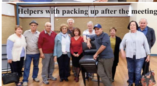
Helpers with packing up after the meeting