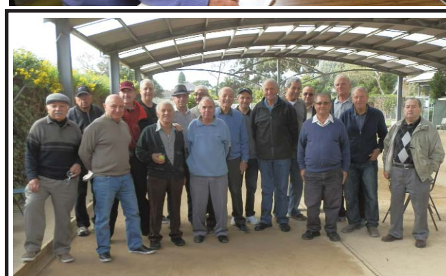
Men's Bocce Group during one of the games