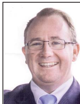
David Feeney MP