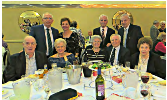
Photos from Seniors Mother’s Day Function held at Melrose Reception on 1st May 2016