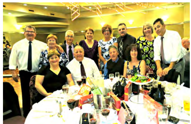
Below: President & Committee members of the Stella Maris Association

We are pleased to say that we had 37 guests with us for this function, many of whom enjoyed the event and requested application forms to join us as members. All I can say is we must be doing something right. Thank you all for being part of the Newport Seniors' Group success story.