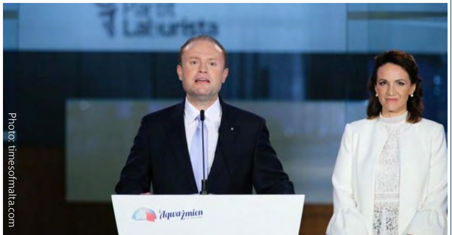
Prime Minister Dr Joseph Muscat and Mrs Michelle Muscat

The Panama Papers affair involved a massive data leak from the Mossack Fonseca law firm that revealed secretive offshore entities used by many of the world's wealthy to stash assets and in some cases evade taxes and launder money.