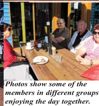
Photos show some of the members in different groups enjoying the day together.