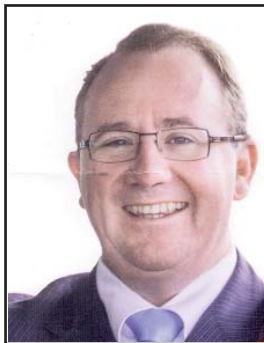
David Feeney MP