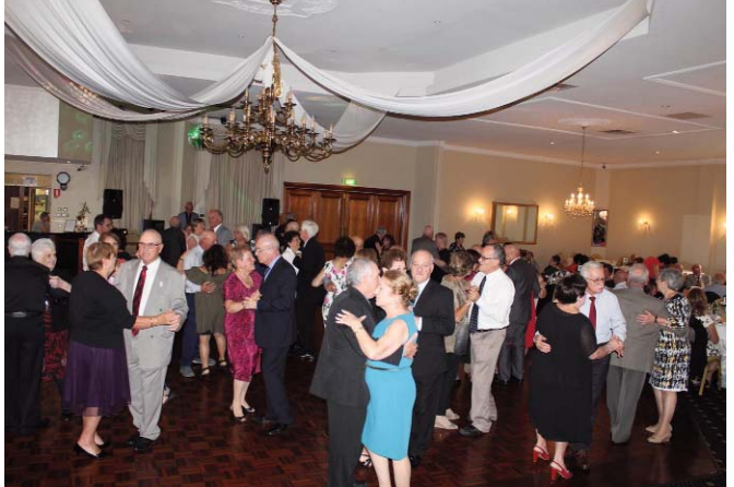
Rest of story and more photos on Pages 2, 4 and 5