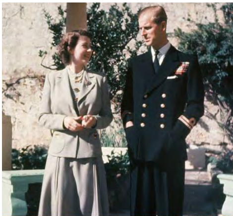
The then-Princess Elizabeth and Prince Philip pictured on their honeymoon in Malta, 1947.

The Queen and Prince Philip's former Maltese idyll Villa Guardamangia will be reconstructed from its crumbling state and opened to the public as a museum.