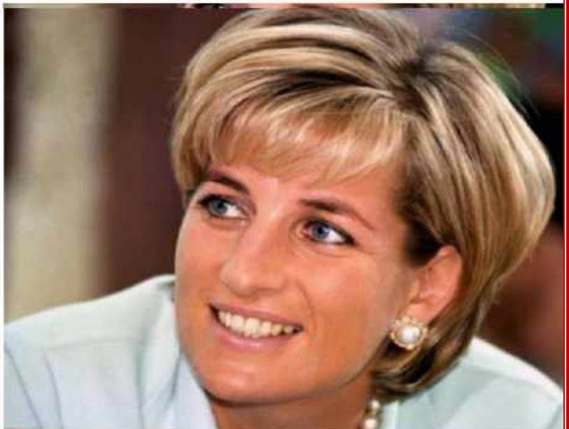
Princess Diana statue to be installed to mark her 60th birthday