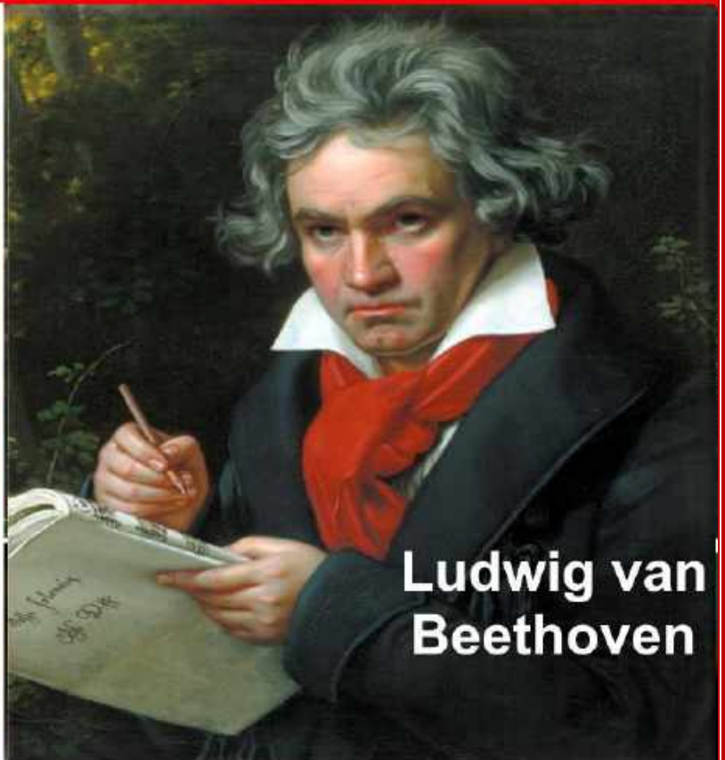
Ludwig van Beethoven