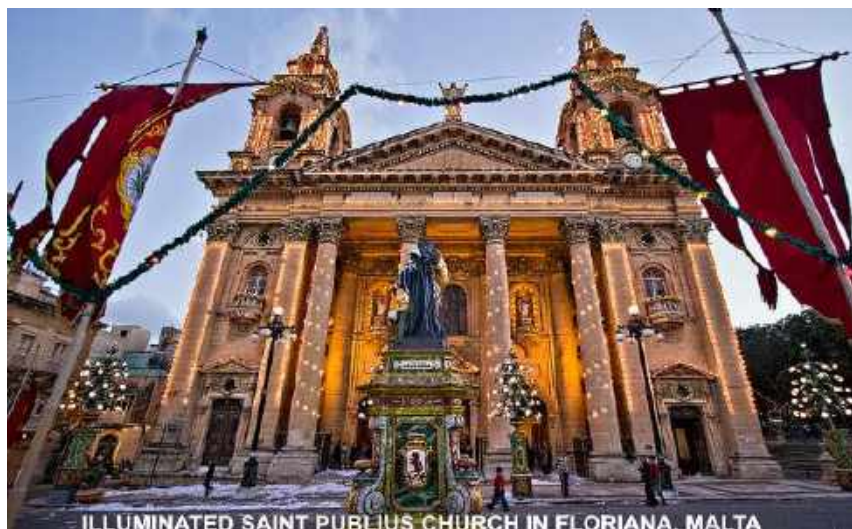
ILLUMINATED SAINT PUBLIUS CHURCH IN FLORIANA, MALTA