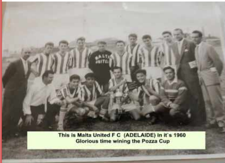
This is Malta United F.C. (ADELAIDE) in its 1960 Glorious time winning the Pozza Cup

I'm looking forward to do it again if re-elected. Your support would be greatly appreciated.