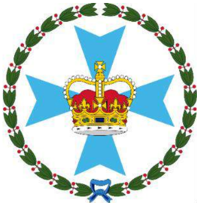
Why is the Maltese Cross included in Queensland's Coat of Arms?

The inclusion of the Maltese Cross in the Queensland Badge and Coat of Arms has an interesting and somewhat inconclusive history.