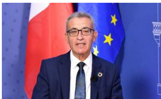
Hon Evarist Bartolo - Minister