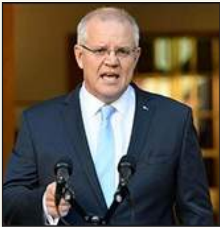
Prime Minister Scott Morrison