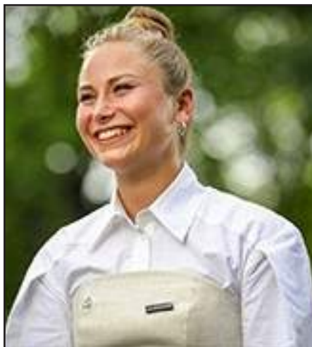
Australian of the Year 2021 Grace Tame

Meanwhile, Mr Malcolm Turnbull, was appointed a Companion of the Order for his service to Australians. All past Australian prime ministers have been offered the honour - the highest level of appointment to the