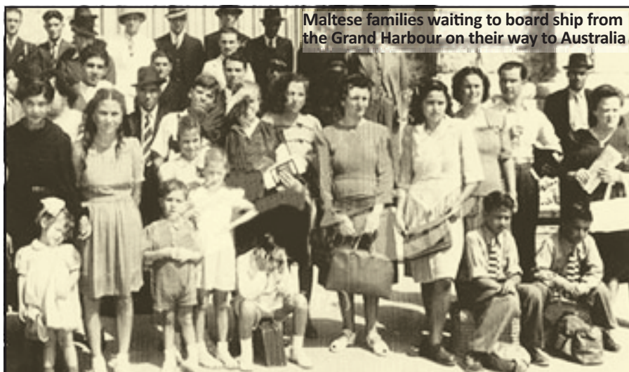
Maltese families waiting to board ship from the Grand Harbour on their way to Australia

the Maltese Islands, sooner or later awaits us."