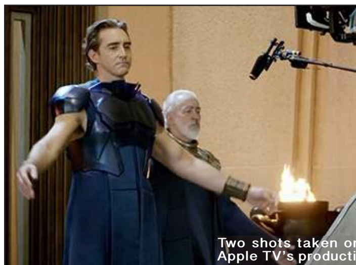
Two shots taken on the set of the Apple TV's production, Foundation