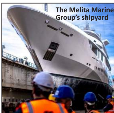
The Melita Marine Group's shipyard