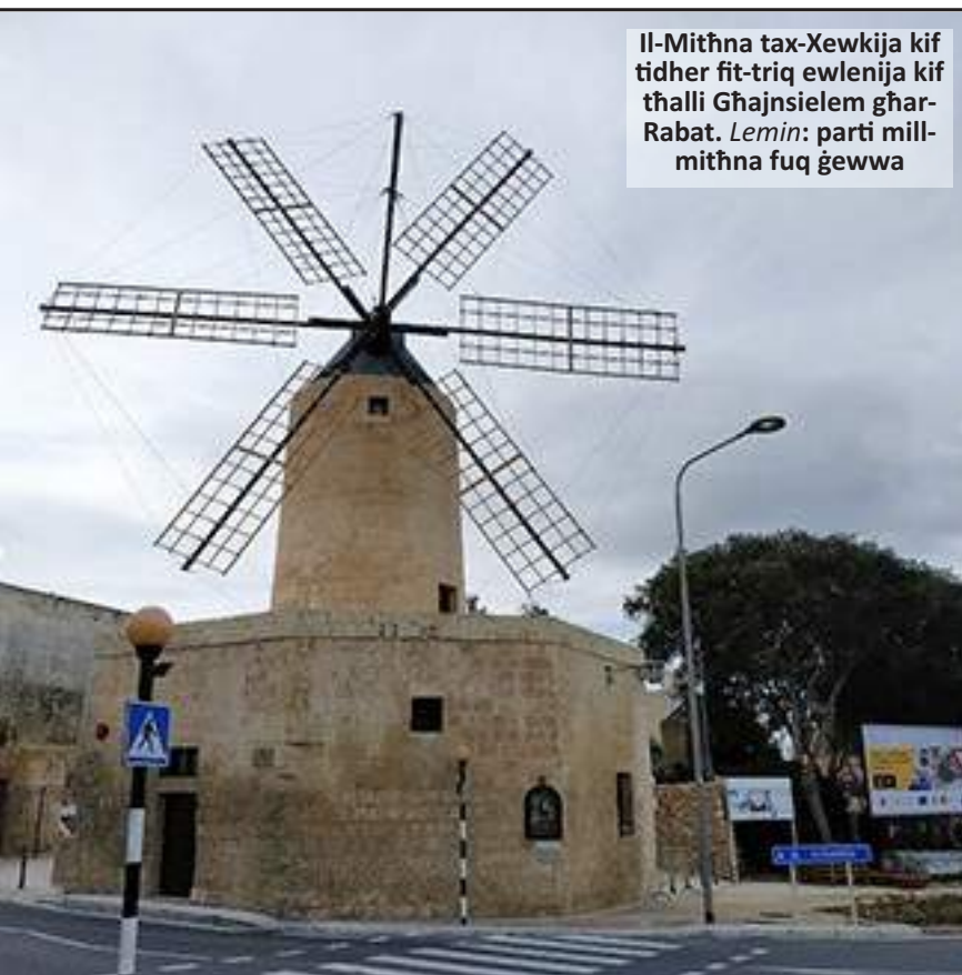
Il-Mithna tax-Xewkija kif tidher fit-triq ewlenija kif thalli Ghajnsielem ghar-Rabat. Lemin: parti mill-mithna fuq ġewwa