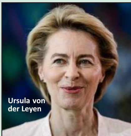
Ursula von der Leyen