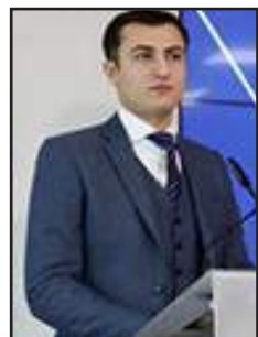
Minister Silvio Schembri

Minister for the Economy and Industry Silvio Schembri said that with a leadership mentality in the digital economy, the government is aiming to further strengthen its position as a Malta that enjoys a reputation of a digital island, built on innovation, good governance, and effectiveness.