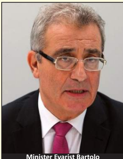
Minister Evarist Bartolo

The Forum of Maltese experts living abroad would be expected to offer a vision for Malta's global contribution in "network of expertise." It would then "identify niches of opportunity for common endeavours", enabling it to contribute "to a vision of a future Malta... as an active contributor in both the regional and global level."