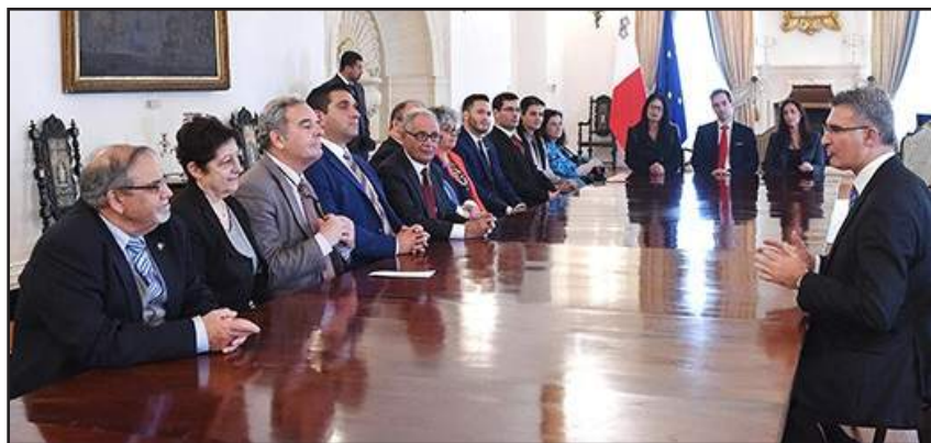
The members of the Council of the Maltese Living Abroad in their meeting in 2018 under the chairmanship of Minister Carmelo Abela

The lack of interest in the concept of The Greater Malta that constitutes more than half of the Maltese citizens in the world comes from the top echelons of Maltese society and especially the media.