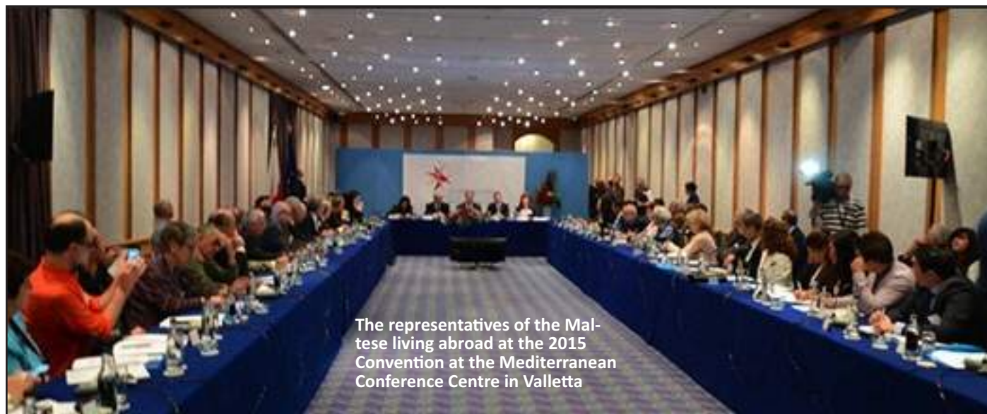
The representatives of the Maltese living abroad at the 2015 Convention at the Mediterranean Conference Centre in Valletta