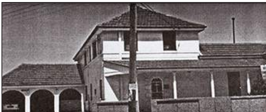
Below: The Friary that was built in 1978 and then demolished again in 1993 to make way for the new church

was bought and the factory demolished making way for a friary for the priests and a church hall. The extensions were blessed and officially opened on Sunday the 10th