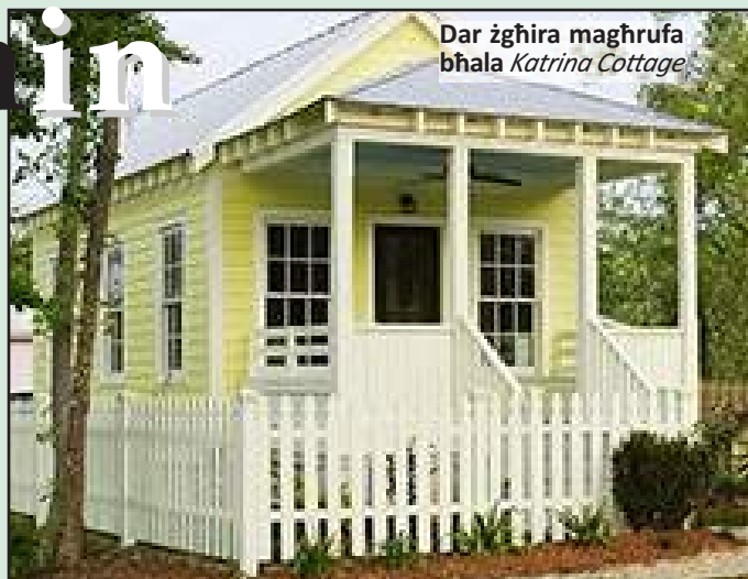
Dar żghira magħrufa bħala Katrina Cottage

Hemm ukoll organizzazzjoniet li qegħdin jiehdu l-opportunità ta' dawn id-djar ċkejkna biex jipprovdu dar b'mod sussidjat għal dawk