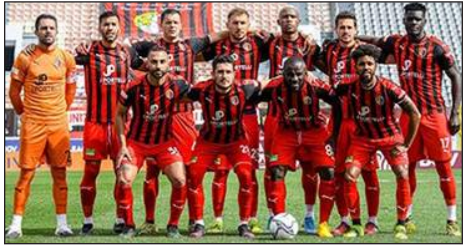
Hamrun Spartans, winners of the Malta Premier League 2021/21

The Association's Executive Committee concluded that the eventual resumption of the 2020/21 domestic competitions was not possible in the current circumstances, therefore it terminated all competitions, invoking a new rule introduced last year, that the classification following the last match