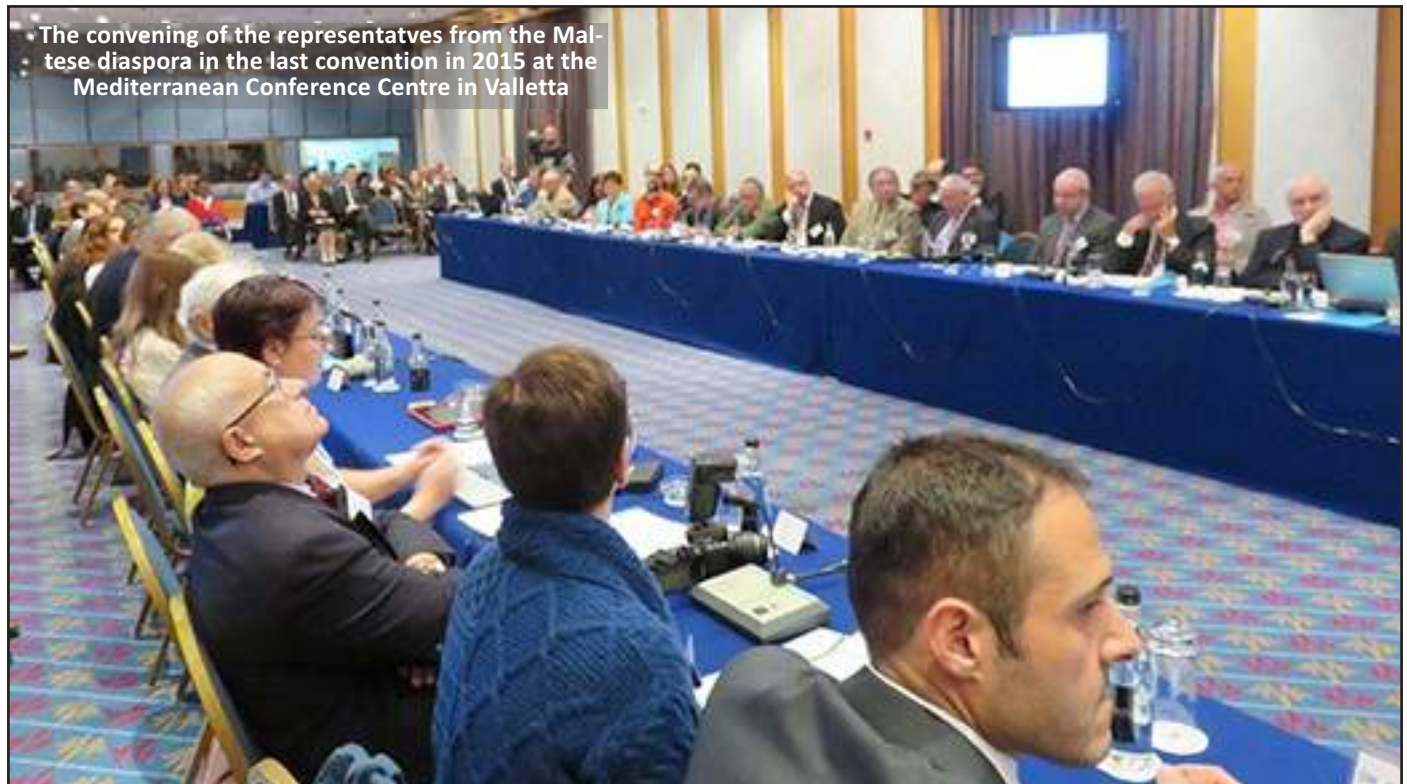
The convening of the representatives from the Maltese diaspora in the last convention in 2015 at the Mediterranean Conference Centre in Valletta