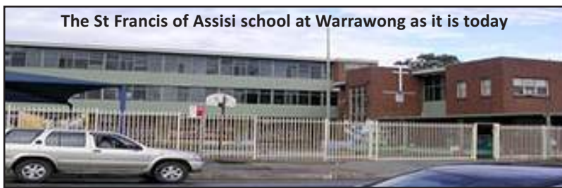
The St Francis of Assisi school at Warrawong as it is today