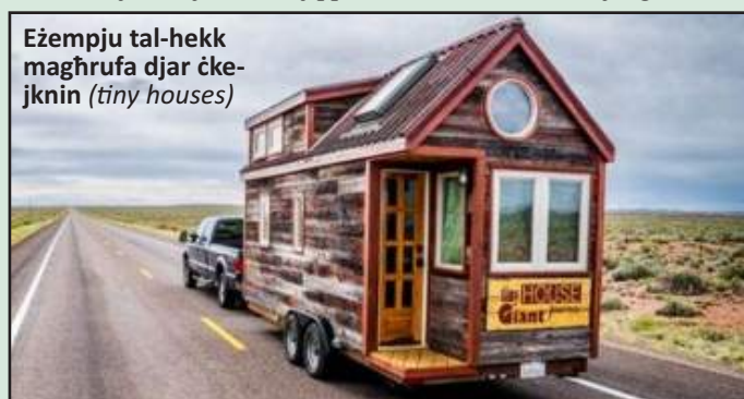
Eżempju tal-hekk magħrufa djar ċkejkni ( tiny houses )