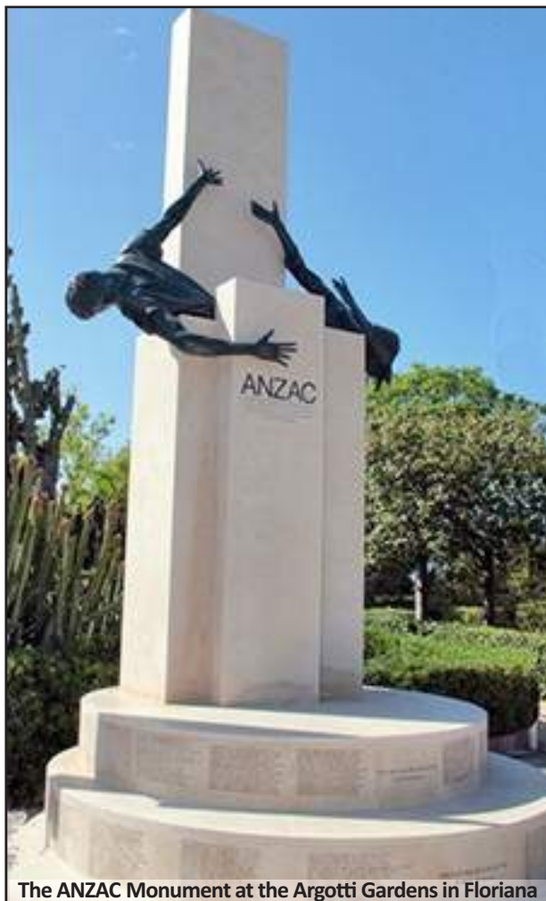
The ANZAC Monument at the Argotti Gardens in Floriana

The ANZACs' ranks included 48 Maltese Australians and six Maltese New Zealanders who gave up everything to fight for their adoptive countries. In addition, Malta looked after many of the injured and evacuated troops in