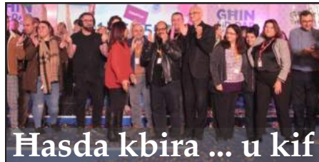
Hasda kbira ... u kif

Malta kienet fost xi pajjiżi ohra tal-Unjoni Ewropeja li ressu l-proposta biex l-UE tohroġ speċi ta' passaport tat-tilqima tal-Covid li bih wieħed ikun jista' jżur pajjiżi ohra tal-Unjoni Ewropea.