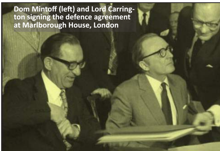
Dom Mintoff (left) and Lord Carrington signing the defence agreement at Marlborough House, London

Malta is also part of the story of the many nations that from time to time have occupied our country. They have all left behind fingerprints of their culture, traditions and language. They were the Phoenicians, the Carthaginians, the Romans, the Normans, the Arabs, the Knights of the Order of St. John, the French and the British.