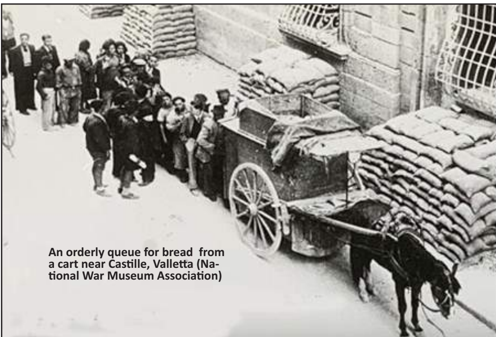
An orderly queue for bread from a cart near Castille, Valletta