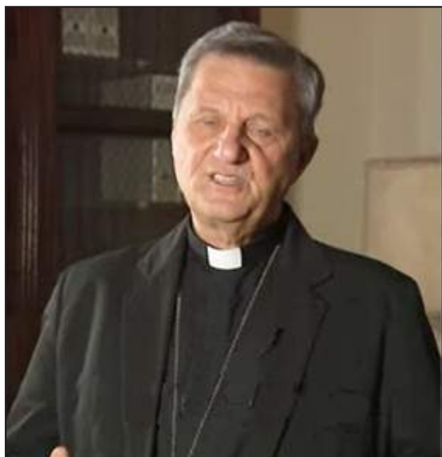
Cardinal Mario Grech making announcing the next Synod