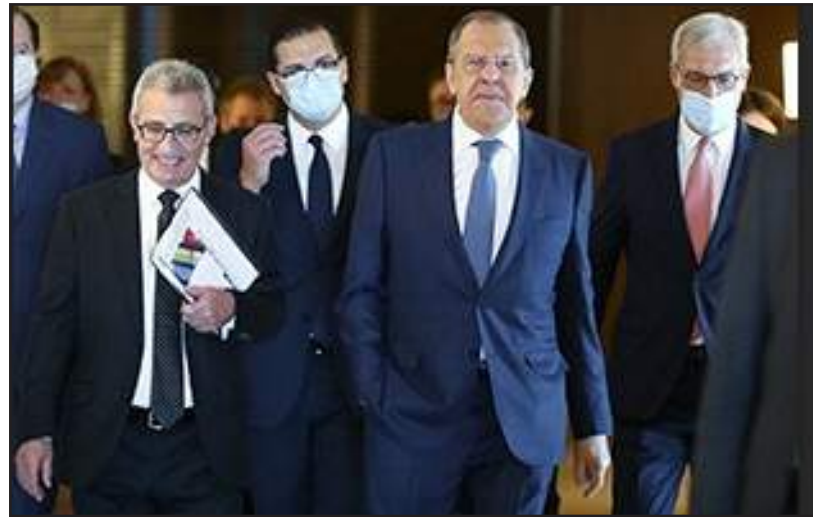
Minister Evarist Bartolo (left) with Minister Sergey Lavrov in Sochi

Evarist Bartolo concluded that Malta is also happy to work with Russia in the fight against all forms of intolerance and maintained that if we want to learn from history, we must also make sure to set the record straight on WWII and to recognise the very important role that Russia played in the victory over Nazism which put the rest of humanity at risk