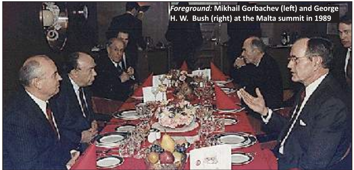
Foreground: Mikhail Gorbachev (left) and George H. W. Bush (right) at the Malta summit in 1989

Weather-wise, they could not have chosen a worse three days. According to the weathermen, it was the worst in living memory.