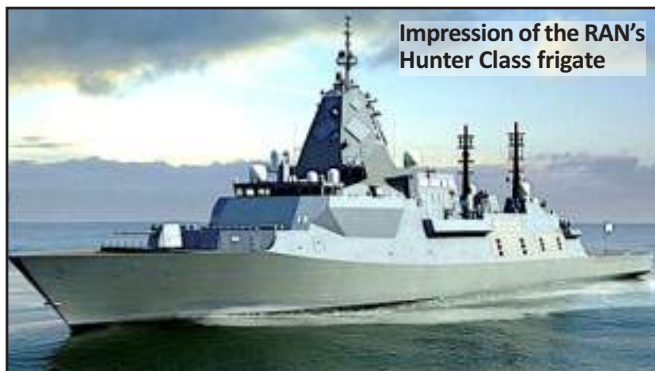
Impression of the RAN's Hunter Class frigate