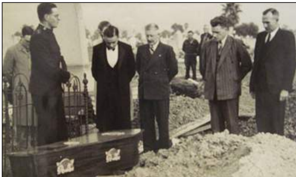
The Somerton Man was laid to rest at West Terrace cemetery in June 1949.