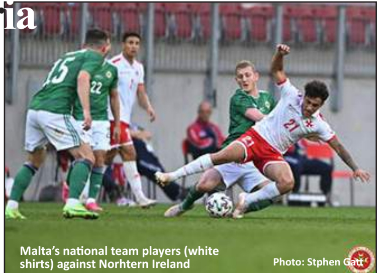
Malta's national team players (white shirts) against Northern Ireland