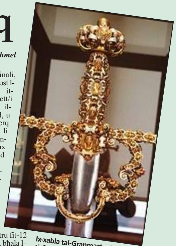
Ix-xabla tal-Granmastru La Valette li tiehdet minn Malta fi żmien Napuljun u għadha tinsab fil-Mużew Louvre

Jien ma nifhimx kif dan il-prinċipju ma japplikax għar-Repubblika Franċiża, meta l-era ta' Napuljun spiċċat b'telfa fil-battalja ta' Waterloo fl-1815 kontra l-allegati tal-Gran Brittanja, l-Olanda, il-Prussja u xi oħrajn. Huwa fl-interess ta' Malta li ninsistu li dak li nsteraq jintradd lura.