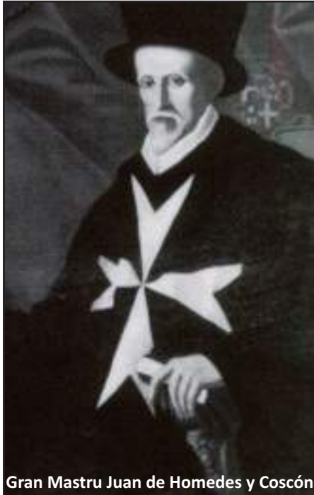
Gran Mastru Juan de Homedes y Coscón