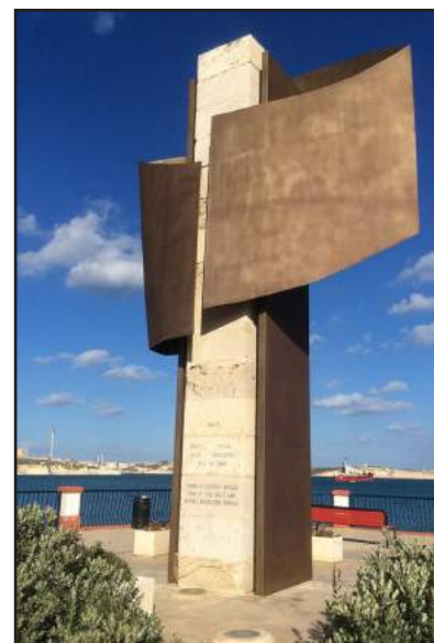
Monument in Birzebbuga commemorating the Malta summit