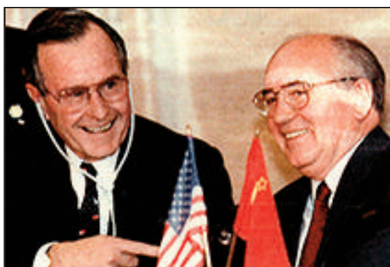
A smiling Bush and Gorbachev after achieving their goal

This was one other important occasion that I would be proud to recount to my next generation, that “I was there”