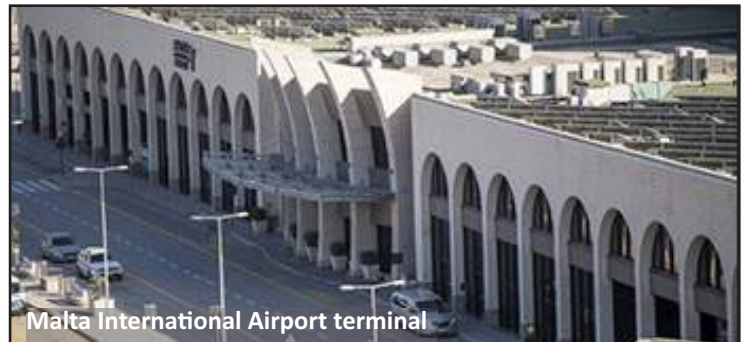
Malta International Airport terminal

The figures published recently published indicate that the airline Ryanair dominated the carriage of passengers with 263,582 followed by the national airline Air Malta with 147,052.