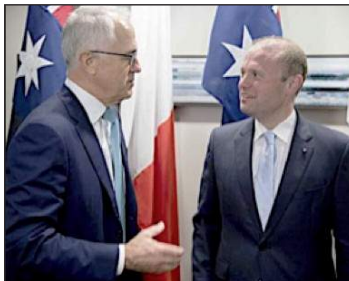
Malcolm Turnbull greeting Malta Premier Joseph Muscat in 2018

Malcolm Turnbull married Lucy Hughes in the Church of England on the 2nd