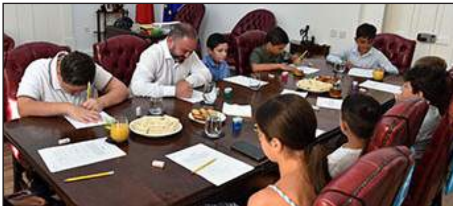
Il-Ministru Owen Bonnici (it-tieni mix-xellug) f'diskussjoni mat-tfal dwar il-kultura u l-arti