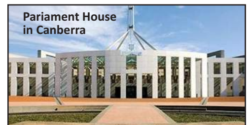
Parliament House in Canberra

The new government is set to introduce 18 pieces of legislation in the first sitting week, as it takes over after nine years on the Opposition benches.