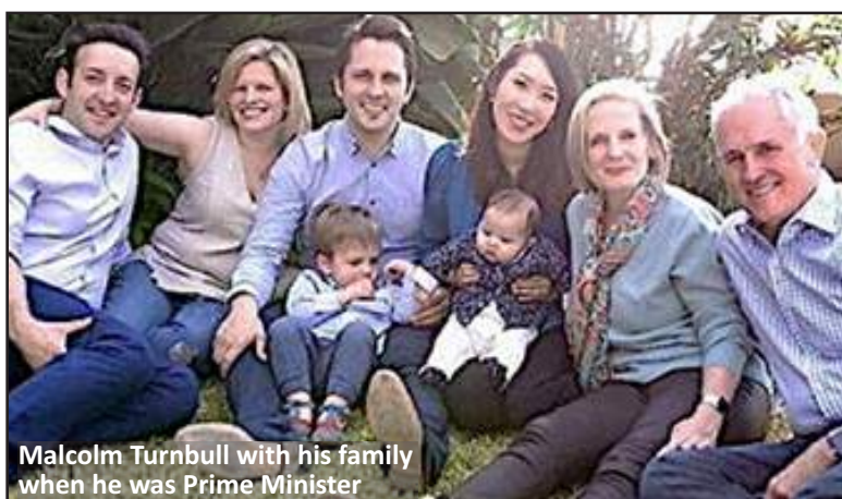
Malcolm Turnbull with his family when he was Prime Minister

Having been an advocate of this idea, Turnbull cheered this result, and on the 7th December, "Same