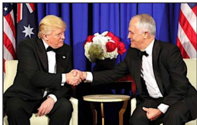
Malcolm Turnbull (right) with US President Donald Trump in 2017

*Next to be featured will be Sir William McMahon, the 20th Australian PM who had the longest continuous ministerial service in Australian history from 1908 to 1988. He was a government minister for 21 years.