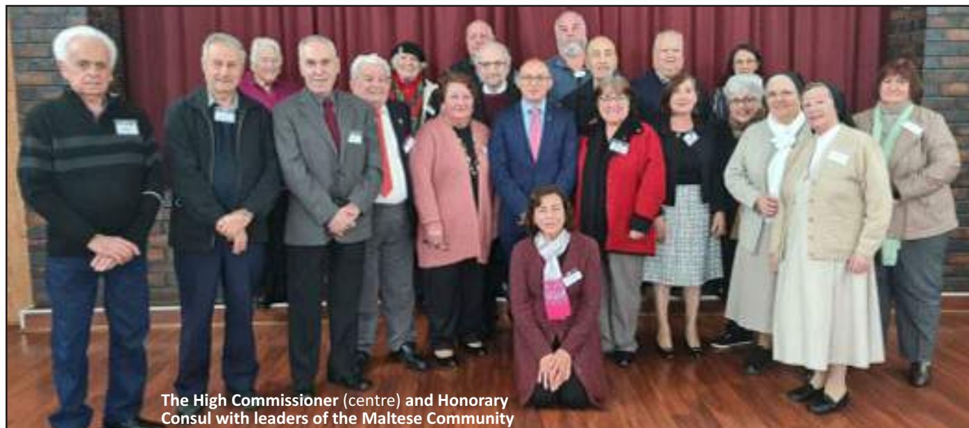
The High Commissioner (centre) and Honorary Consul with leaders of the Maltese Community