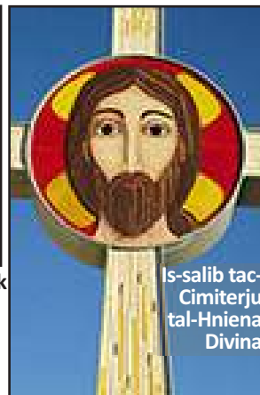
Is-salib taċ-Ċimiterju tal-Hniena Divina