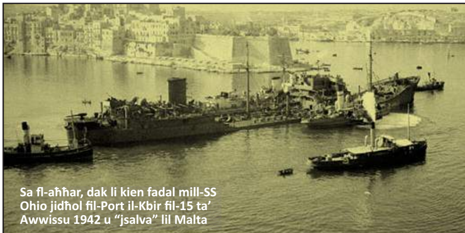
Sa fl-aħħar, dak li kien fadal mill-SS Ohio jidhol fil-Port il-Kbir fil-15 ta' Awwissu 1942 u "jsalva" lil Malta

madwar 20 mil bogħod minn Malta, fil-waqt li l- oiler għeraq tmien mili biss minn Malta.