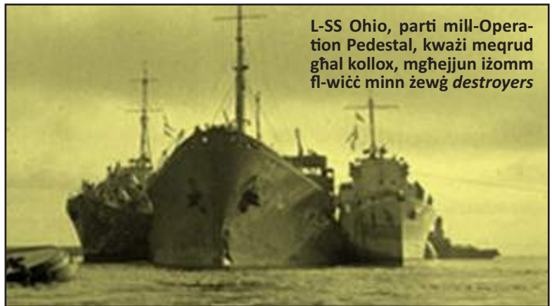
L-SS Ohio, parti mill-Operation Pedestal, kważi meqrud għal kollox, mgħejjun iżomm fl-wiċċ minn żewġ destroyers

Kien l-aħħar vjaġġ tal-Ohio għax tant sofrat tifrik li wara li ħadt, ittieħed fil-bajja tar-Rinella u nqasam fi tnejn. Erba' snin wara, l-fdalijiet tiegħu nħargu barra l- breakwater u ġew mgharraq.