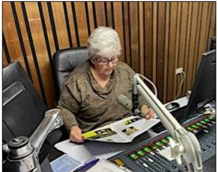
Maltese Community Radio presenters in Adelaide seen reading The Voice of the Maltese magazine during their programmes