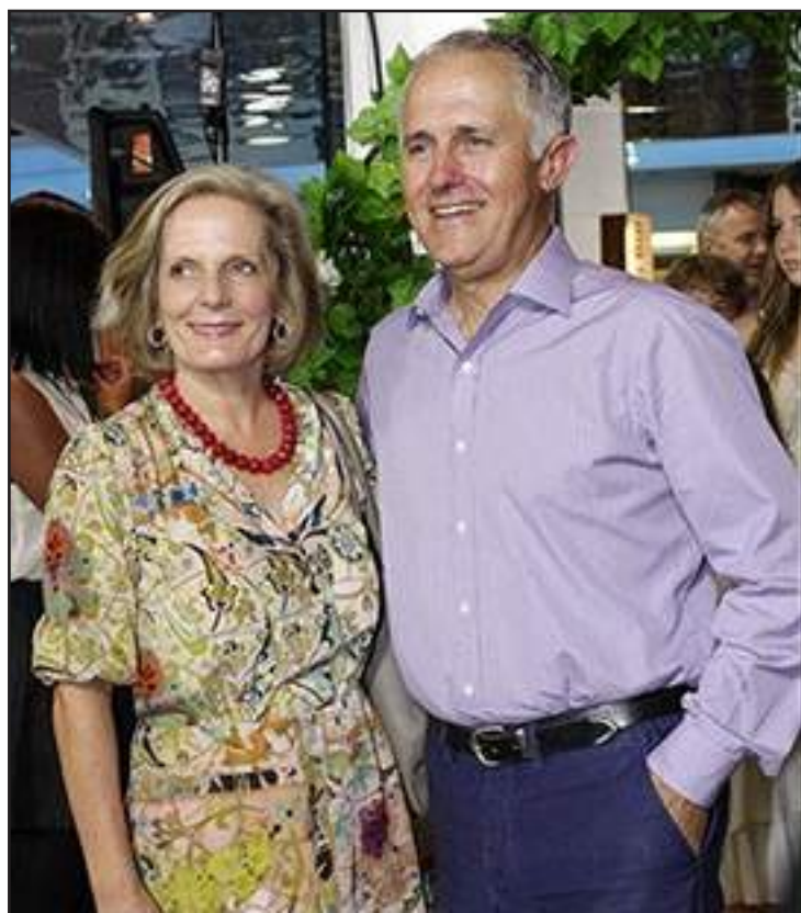
◀Malcolm Turnbull and his wife Lucy Turnbull in January 2012