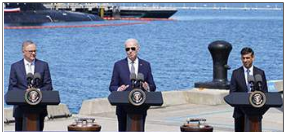
Australia's Anthony Albanese, US President Joe Biden and UK's Prime Minister Rishi Sunak

President Biden said, "I want to be clear to everyone from the outset, right off the bat, so there's no confusion or misunderstanding on this critical point: These subs are will be nuclear-powered, not nuclear-armed".