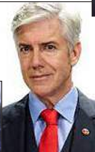
TV personality and actor Shaun Micallef