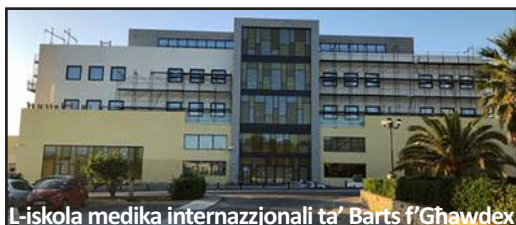
L-iskola medika internazzjonali ta' Barts f'Għawdex

X'aktarx li l-aktar deċiżjoni importanti li ħarġet mid-dibattitu kien li l-Prim Ministru kellu jitlob lill-Awditur Ġenerali (kif fil-fatt għamel), halli jistharreg l-allegazzjoni tal-Oppożizzjoni li Steward Healthcare li kienu qed imexxu t-tliet spartarjiet – dak Ġenerali t'Għawdex, il-Karin Grech u San Luqa - ħadet €400M u ma tawx valur lura f'servizz.