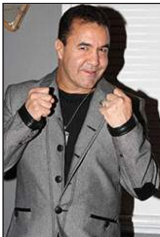
Jeff Fenech (above) and Mario Fenech (right) excelled in sports

We are no longer the odd fish to have a 'funny-sounding name'; there are many other people out there with 'funny-sounding names'.