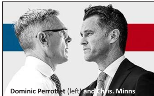
Dominic Perrottet (left) and Chris Minns

The Coalition is heading into this election with an already shaky hold on power. Of the 93 seats in Legislative Assembly — which is where the government is formed — the Liberals currently hold 33, while the Nationals have 12. Labor has 36 seats and there is an expanded crossbench with three Greens MPs as well as nine independents, which include three who quit the Shooters, Fishers and Farmers Party and one who resigned from the ALP.