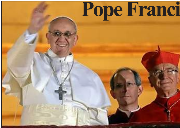
Pope Francis on the balcony of St Peter's Basilica in March 2013