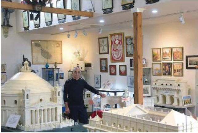
Packed: The Maltese Museum is stacked with Maltese artefacts, from throughout its history.