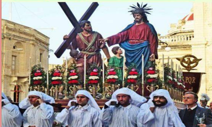
Good Friday in Malta

This is the anniversary of the withdrawal of British troops and the Royal Navy from Malta in 1979.