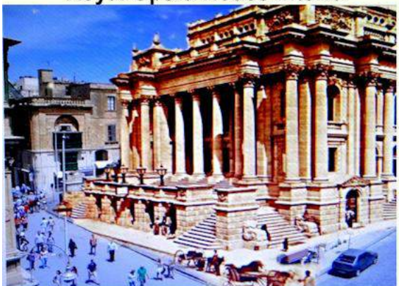
Royal Opera House - Valletta