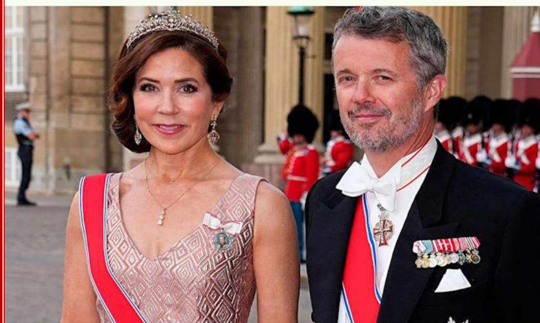
KING FREDERIC AND QUEEN MARY OF DENMARK THE FIRST AUSTRALIAN-BORN TO BECOME QUEEN

Doninu Malta: Empowering Lives, Inspiring Hope doninu.eu