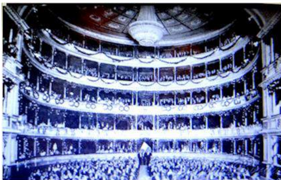
Royal Opera House Interior