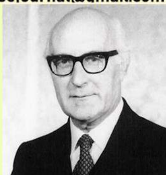
Sir Anthony Mamo First President of Malta