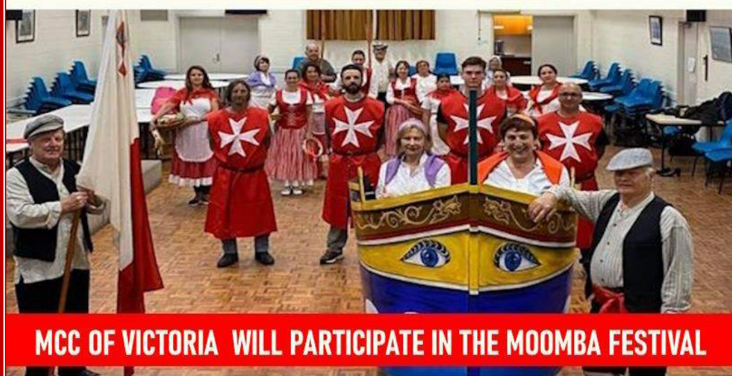
MCC OF VICTORIA WILL PARTICIPATE IN THE MOOMBA FESTIVAL