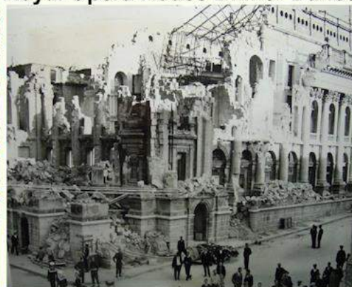
Bombed during WW2

Located majestically at the entrance to Valletta, the Royal Opera House used to stand on Strada Reale (Kingsway, now called Republic Street), flanked by South Street and Ordnance Street. The project was entrusted to Edward Middleton Barry, the architect of Convent Garden Theatre, London, who designed the Royal Opera House in the Neo-Baroque style which had become fashionable in Europe and ensured the popularity of this building with the Maltese public*. The project started in 1860, although it was delayed when