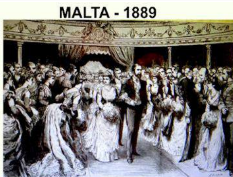
Royal Opera House Dinner Dance