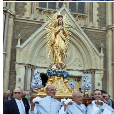
Some of the photos taken during the Vitoria Dinner Dance and the Feast of Maria Bambina at St. Mary's Church, West Melbourne. Both went well.