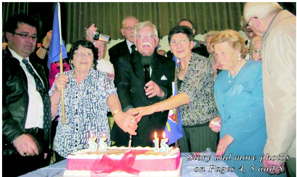
Story and more photos on Pages 4, 5 and 8

ON Sunday, 14th August, Reskeon members celebrated the 35th anniversary of Reskeon Maltese Association and the 15th anniversary of the Reskeon Seniors Group with a free four-course lunch at the Maltese Centre, Parkville.