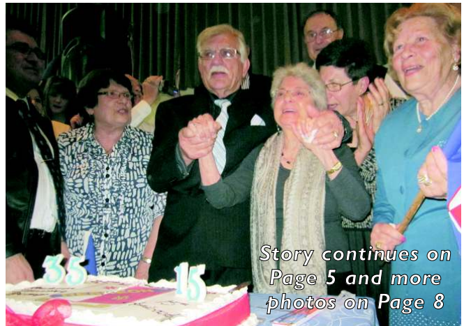
Story continues on Page 5 and more photos on Page 8

Exclusive & Fully Escorted Tour All The Way To Malta