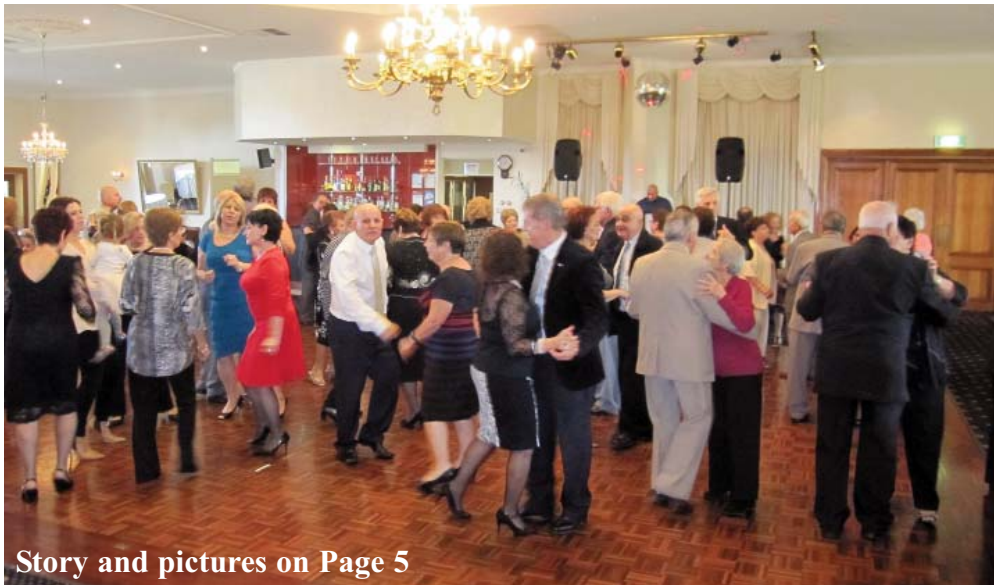
Story and pictures on Page 5

The Reskeon Seniors Group celebrated Father's Day with a Luncheon at Firenze Receptions, Fawkner, on Thursday, 14th August. Around 140 members attended. This number would have been larger if it wasn't for the amount of members holidaying in Malta and others who were suffering with the flu. Pre-drinks and hors d'ouvres were served while members entered the hall and were seated at the tables.