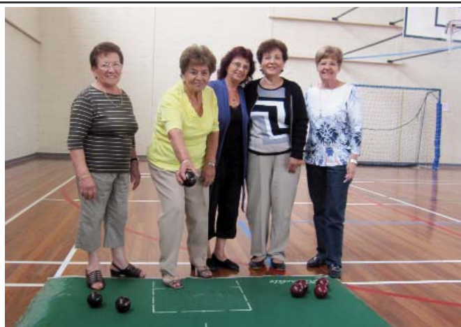
Reskeon Seniors Group Bocce Groups play every week at our meetings at Merrilands Community Centre. On the left is the Men's Bocce Group who at the moment started playing bocce competition and on the right is the Ladies' Bocce Group who are playing bocce competition as well. We apologise that on the day the picture was taken some of the girls were not in attendance.