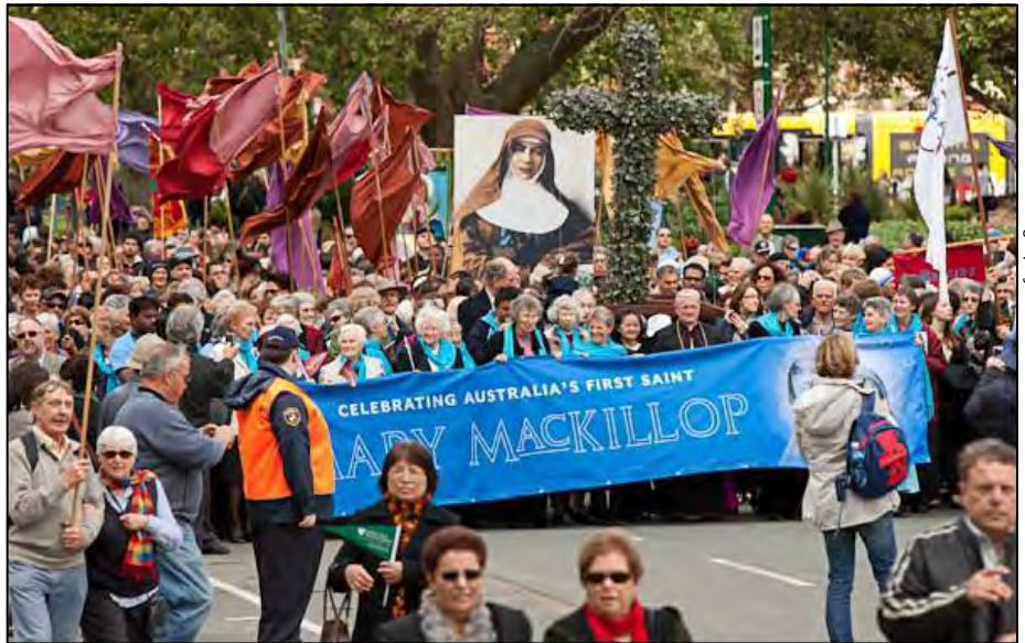
The celebration procession held in Melbourne

Mary MacKillop was born in 1842 in Fitzroy, Melbourne to Scottish parents. From