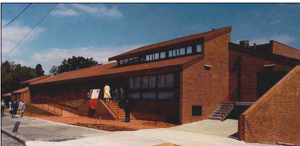
Iċ-Ċentru Malti gewwa Parkville mibni fl-1983 għall-komunità Maltija tal-Victoria fuq l-art tas-Socjetà.