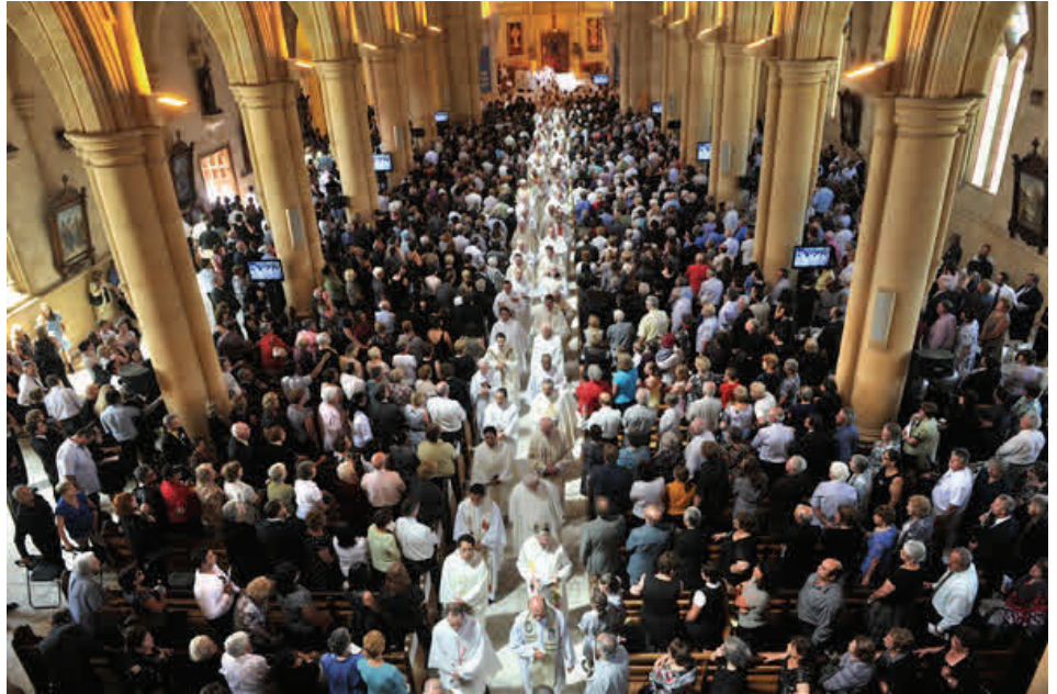
The packed Sacred Heart Cathedral in Bendigo attending the Requiem Mass.