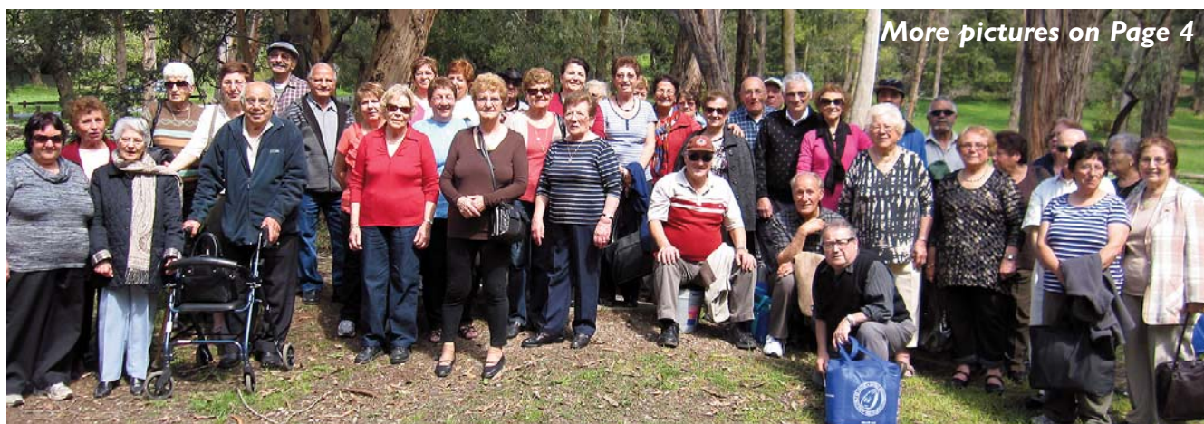
More pictures on Page 4

On Thursday, October 18, a group of 48 members of Reskeon Seniors Group enjoyed a day out to Maroondah Dam and Badger Weir Park.